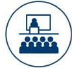
Show Freight & Event Shipping