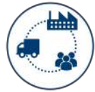
Supply Chain Consulting