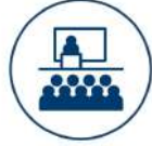
Show Freight & Event Shipping